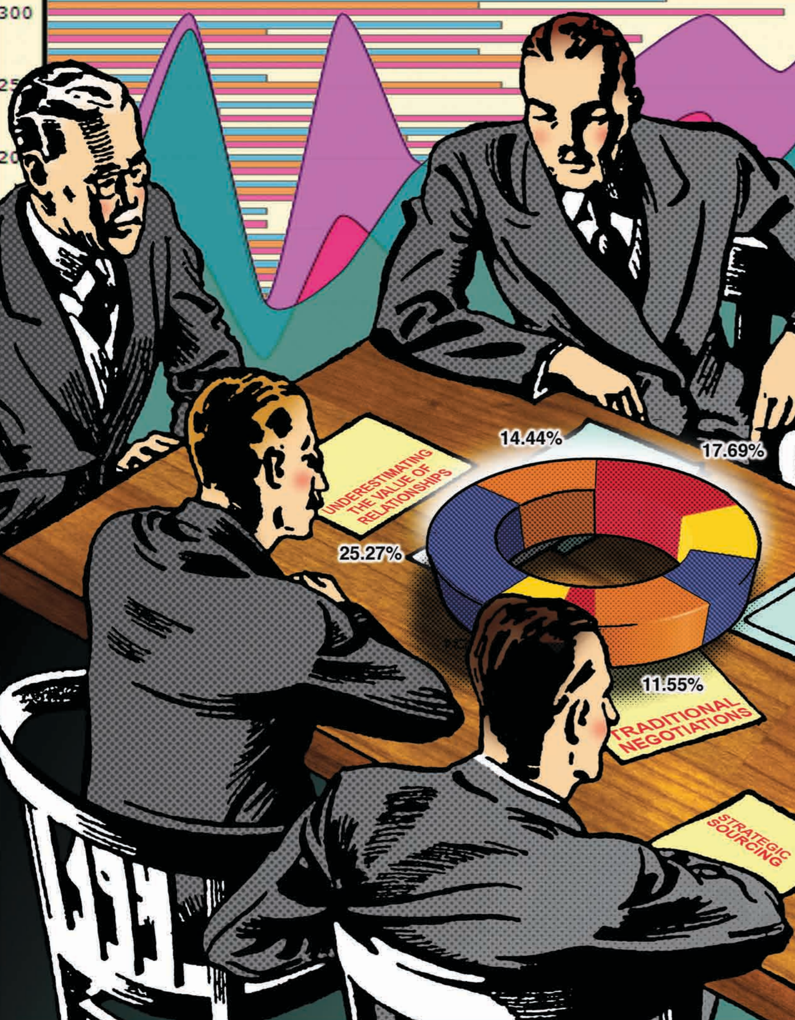
ILLUSTRATION: JOVAN DJORDJEVIC

Similarly, in the business world, parties often miss opportunities at the negotiating table to do better without risking being any worse off; in many cases, options for